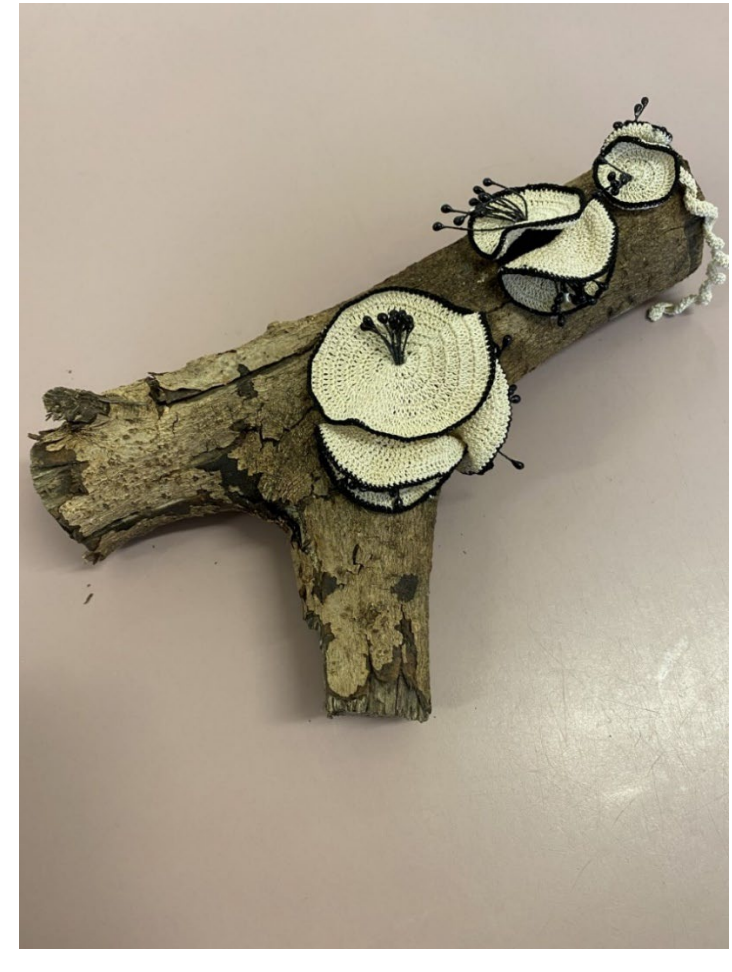
Left photo features Barbara's entry of dimensional snowdrops, and on the right are Norma's crochet flowers.