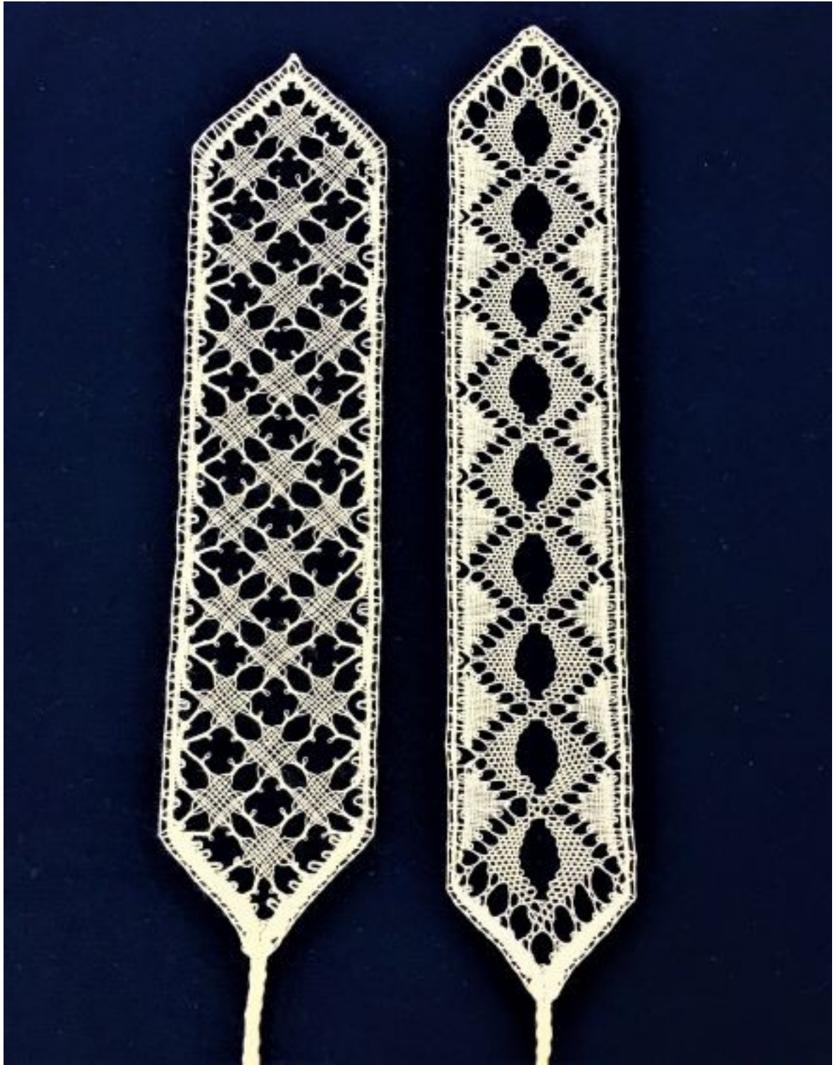
Two bookmarks in DMC 30 by Robyn.