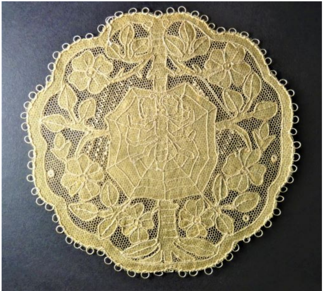
Carrickmacross coaster, 11cm diameter, ecru, Arachne/spinning spider motif in between two tree trunks. (Private collection).